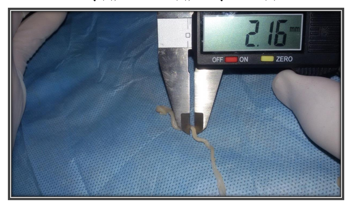
Figure 2. The method of measuring the width of oviduct (external diameter) in goat using digital caliper